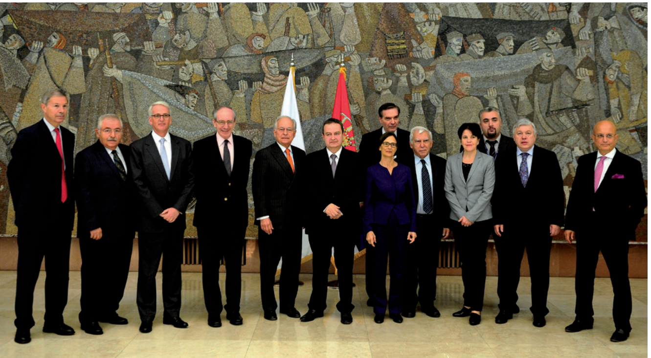
OSCE Chairperson-in-Office, Serbia's First Deputy Prime Minister and Minister of Foreign Affairs Ivica Dačić, with the members of the Panel of Eminent Persons in Belgrade, 2 October 2015.