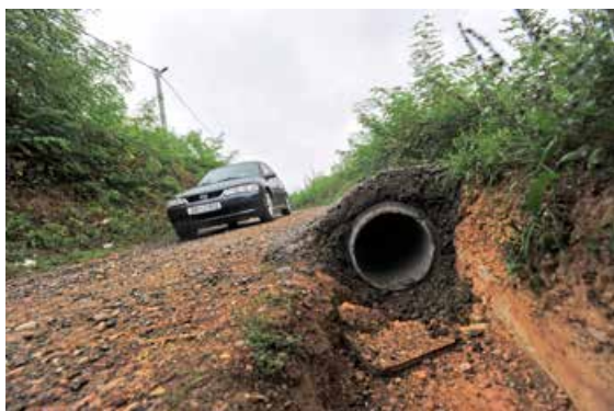
New plastic pipes used for drainage of waste water in Brđani settlement in Prijedor.

The City of Prijedor will be responsible for the maintenance and ongoing costs of electricity for the street lighting, while the maintenance of the sewage channel will be an integral part of its road maintenance programme.