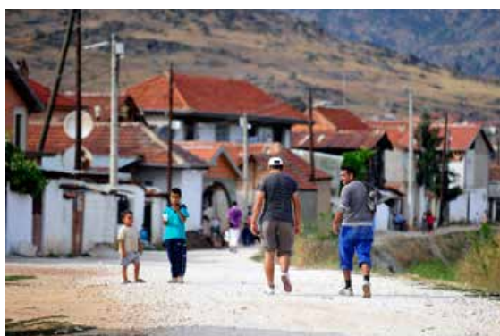
Street lighting was needed in Erdovan Sabanoski Street in the Trizla settlement in Prilep.