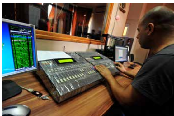
The new equipment for Romani Avazo radio station in Prizren.