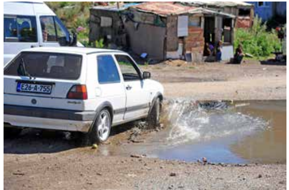
The previous condition of the unrepaired road in the Bišće Polje Roma settlement in Mostar.

The newly asphalted road will have a long lasting impact in the settlement, allowing the Roma community to benefit from better access.