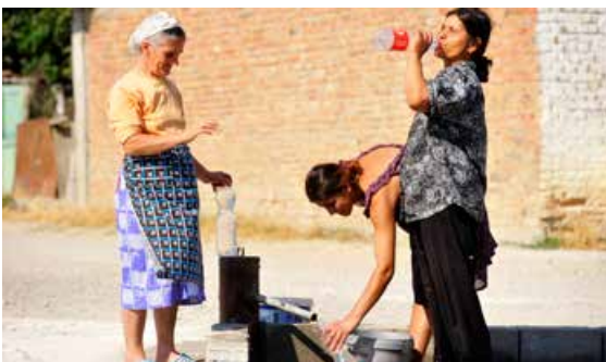
The local community, including Roma, use the newly built water well in Grabian commune.