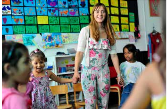
Roma and Egyptian children play and learn with newly hired assistants in Tivat.