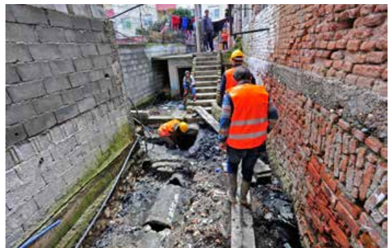
Construction work on the sewage system in Lezhë.