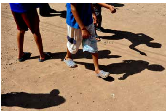
Roma children eagerly await the new playground in the Radanski Pat Roma settlement of in Štip.

This project constructed a children's playground — the first ever to be built in the predominantly Roma settlement of Radanski Pat. The playground is an important meeting place for both Roma and non-Roma children, allowing them to socialize through play.