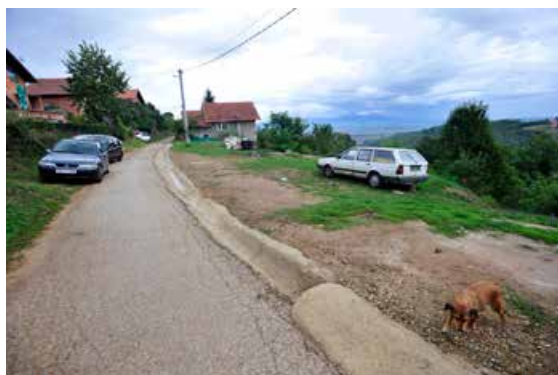
Drainage for waste water was constructed along the road.