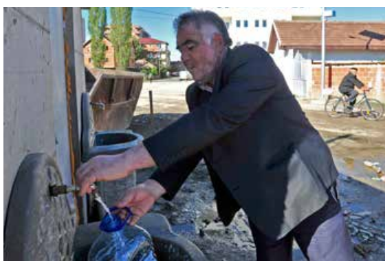
The newly built water well in Fushë Kosovë/Kosovo Polje.

The municipality of Fushë Kosovë/Kosovo Polje is home to 34,827 people, including 436 Roma, 3,230 Ashkali and 282 Egyptians. The inhabitants suffer from a lack of clean drinking water. The problem was more pronounced in Roma, Ashkali and Egyptian settlements, due to their poor living conditions. In order to address the situation, the municipality used the small grant project to dig a well in the Roma, Ashkali and Egyptian Settlement 07, which has approximately 350 inhabitants.