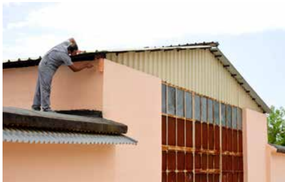
Painting the outer walls of the school.

According to the 2011 census, there are 91 Roma living in Gjirokastër and 21 Egyptians. However, NGOs and municipal officials estimate that some 100 Roma families and over 1,000 Egyptians live in the city.