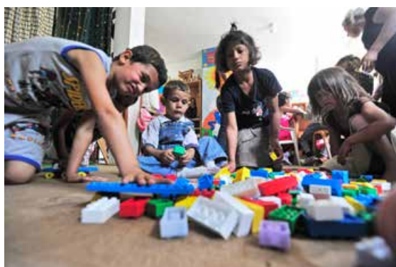
Extra-curricular activities for Roma and Egyptian children in Berane.