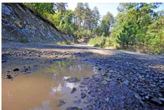
The previous condition of the unrepaired road in the Svatovac Roma settlement in Lukavac.

The Roma settlement of Svatovac is situated in the southern part of the Lukavac Municipality. The 500-metre-long and 3-metre-wide road towards the Svatovac settlement was in very bad condition, bumpy and without drainage. Access to the settlement was impeded during the rainy period because of the debris and frequent landslides deposited on the road.