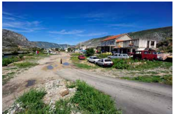
The road prior to asphaltting.