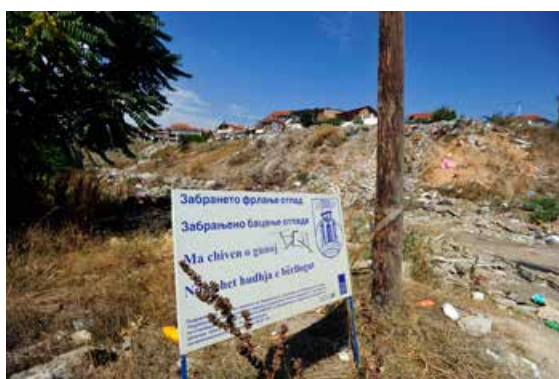
The Roma settlement of Pero Chicho in Kumanovo awaiting cleaning.