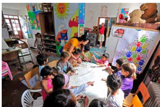
Roma and Egyptian children working with an assistant mediator in Berane.