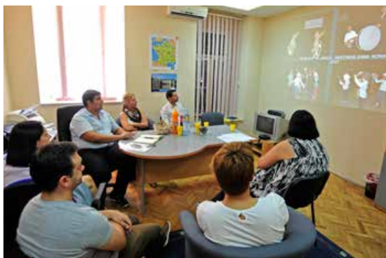
NGO Mladi Romi presenting the project activities and expected results in Herceg Novi.

This project is important for providing Roma children with an opportunity to fully participate in the education programme, improve their language skills and effectively absorb new school material.