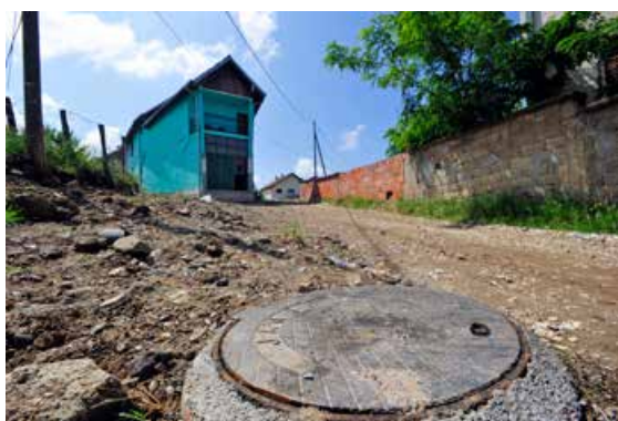
The sewage system after repairs.