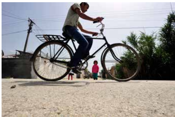
The newly built road in Lushnje.