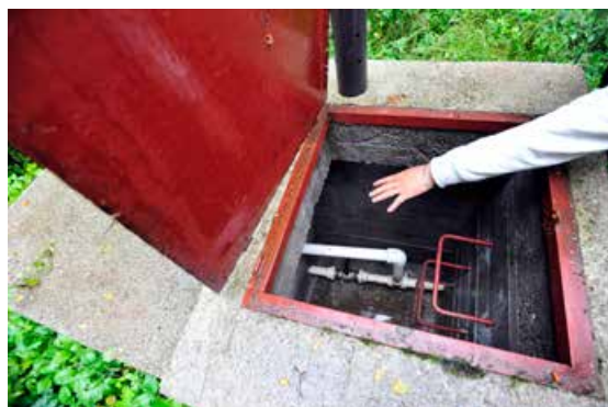
A water reservoir to be connected to the new water source in Jajce.