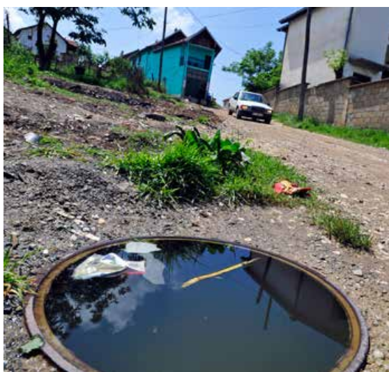
The outdated and non-functional sewage system before repairs in the Roma neighbourhood of Brnješ/Bërnjesh I in Gračanica/Graçanicë.

The direct beneficiaries of this project are 15 families, a total of approximately 75 Roma.