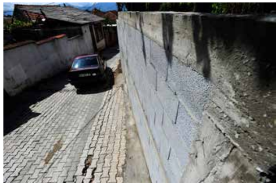
The new support wall in Rahovec/Orahovac municipality.